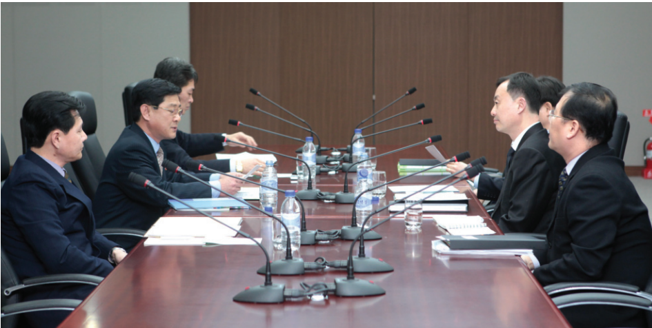
Working-level talks on Mt. Gemgang and Gaeseong tour February 8, 2010

In response, the South explained to the North that the three principles are the most basic conditions under which ROK citizens can enjoy the tours, and that it would be impossible to resume the tours unless the personal safety issue was addressed. The North failed to respond to the South’s position. The two Koreas ended the meeting by agreeing to discuss the schedule for the next meeting through the Panmunjeom liaison offices.