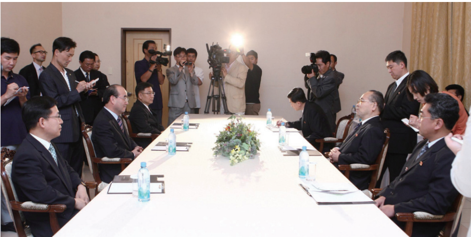
Inter-Korean Red Cross talks, August 26-8, 2009

Although the two Koreas agreed on the Chuseok reunions without revealing significant differences in opinion, they failed to narrow the gap in their positions concerning other matters. They only agreed to continue talking about those issues and adopted an agreement with two provisions as a result.