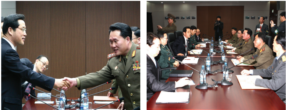
Working-level contact on the “3C” issues, March 2, 2010

Regarding the passage issue, the South proposed the establishment of an RFID system with the North ensuring regular passages starting in March, and the implementation of a daily-basis travel system from May. To speed up customs clearance, the South suggested adopting a selective inspection system, proposing an initial inspection rate of 50 % and gradually reducing it over the long term. Moreover, it emphasized that Internet and mobile communication services should be available within the complex as early as possible to ensure convenient communication.