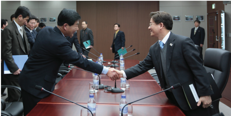
A meeting to assess the joint study tour to overseas industrial complexes

Given the wide gap in views on pending GIC issues, the South proposed to continue discussing issues of common interest step by step. Furthermore, the South suggested holding the next round of working-level GIC talks on February 1, 2010 with the “3C” and dormitory issues on the agenda. However, the North insisted that wage increases should also be included in the agenda during the subsequent round of talks.