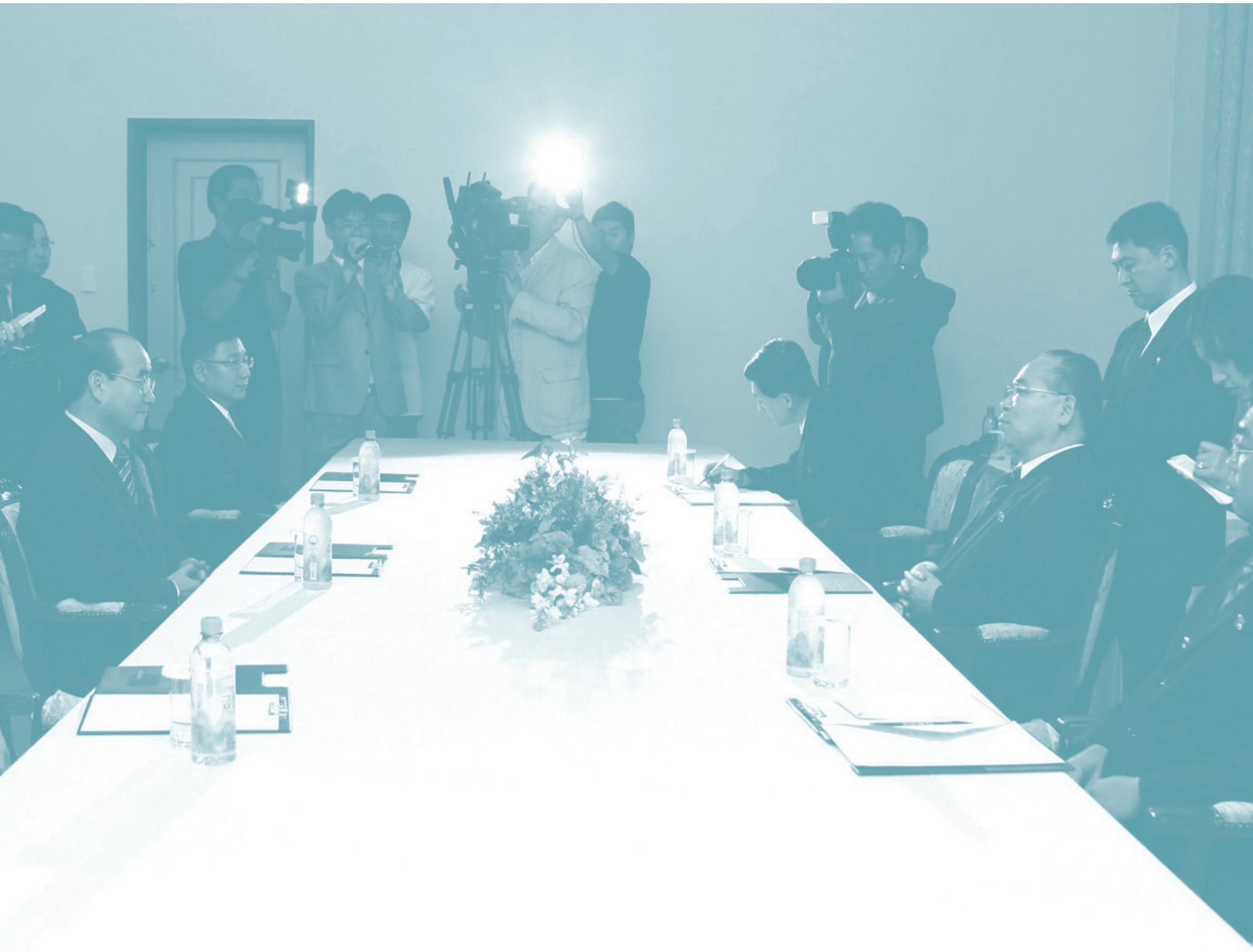
Inter-Korean Red Cross talks, August 2009