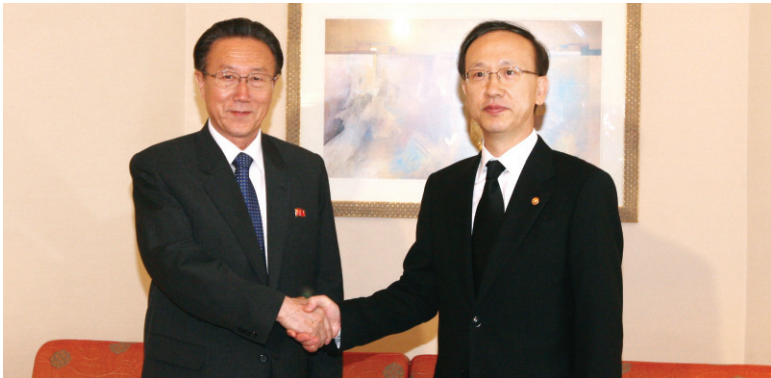
Unification Minister Hyun In-Taek and Director Kim Yang Gon of North Korea’s United Front Department shaking hands, August 2009

The North Korean delegation arrived in Seoul on August 21 and visited the memorial altar for former President Kim Dae-jung set up at the National Assembly. Then, it met with the National Assembly Speaker in his office, in which the National Assembly leader expressed his gratitude for their mourning, emphasized the need for mutual benefits and common prosperity between the two Koreas, and urged an early release of the South Korean sailors and ship that was detained by North Korea on July 30. Secretary Kim expressed his condolences on the death of former President Kim Dae-jung. The delegation also visited the Kim Dae Jung Peace Center and delivered a letter written by Chairman Kim Jong Il to Madam Lee Hee-ho, widow of the late President Kim.