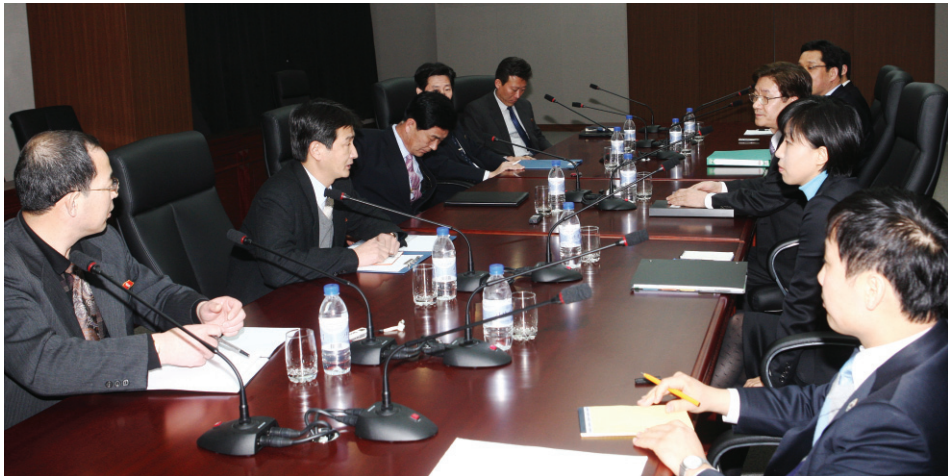
Working-level talks on GIC issues, February 1, 2010

refused to discuss issues that it believes are not related to the GIC and argued that the North Korean military actions were legitimate military exercises. The two Koreas agreed to hold working-level military talks on the “3C” issues at a later date and to continue discussions on wages and dormitories at the next working-level meeting. The two sides agreed that the South would notify the North regarding the venue and date of the future working-level military talks.